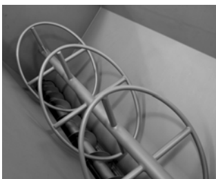
Optional product agitator prevents bridging