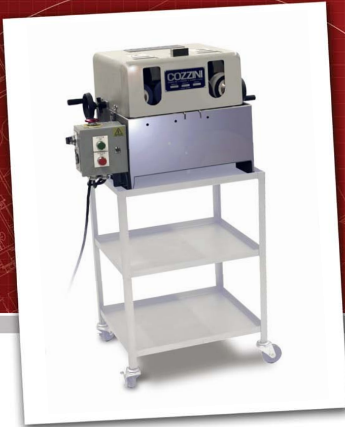
Shown with optional cart.

PRIME Edge® COZZINI CUTTING EDGES AND SHARPENING SOLUTIONS