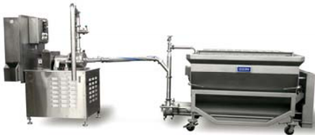
AR701MC system shown with screw loader

PrimeCut™ COZZINI EMULSION/REDUCTION SYSTEMS